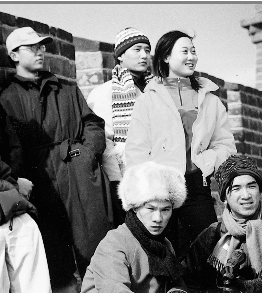
Jack Ma and colleagues on a rare outing to the Great Wall in 1999. Ma and his early core team were working for a subsidiary of the Ministry of Foreign Economic Relations and Trade at the time. This photo preceded their return to Hangzhou and was taken at a time when the future seemed bleak.