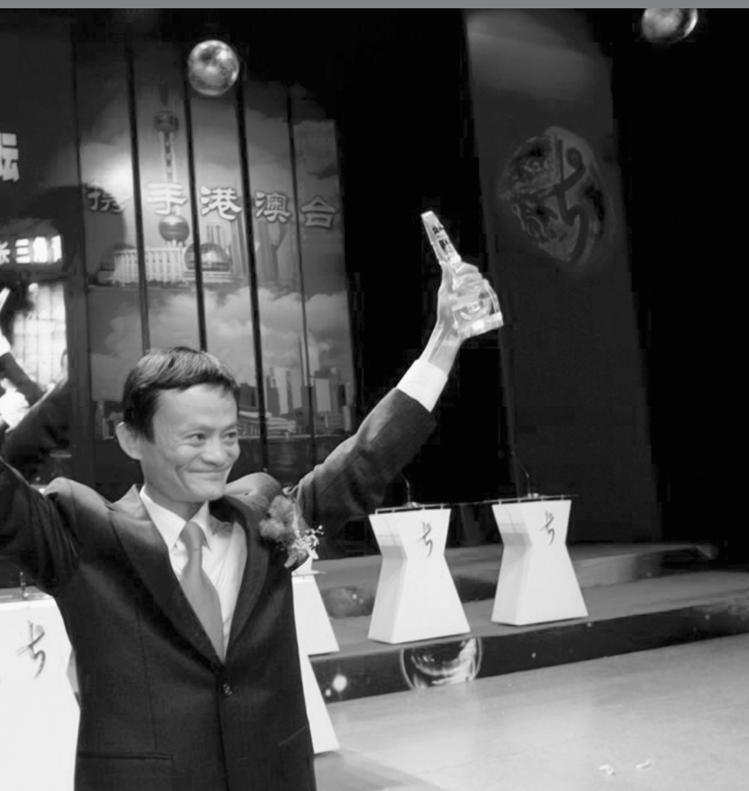
In 2006, Ma was honored with an award called the Yangzi River Delta Award. It recognizes entrepreneurial achievement and specifically awards the leadership of innovative young people.