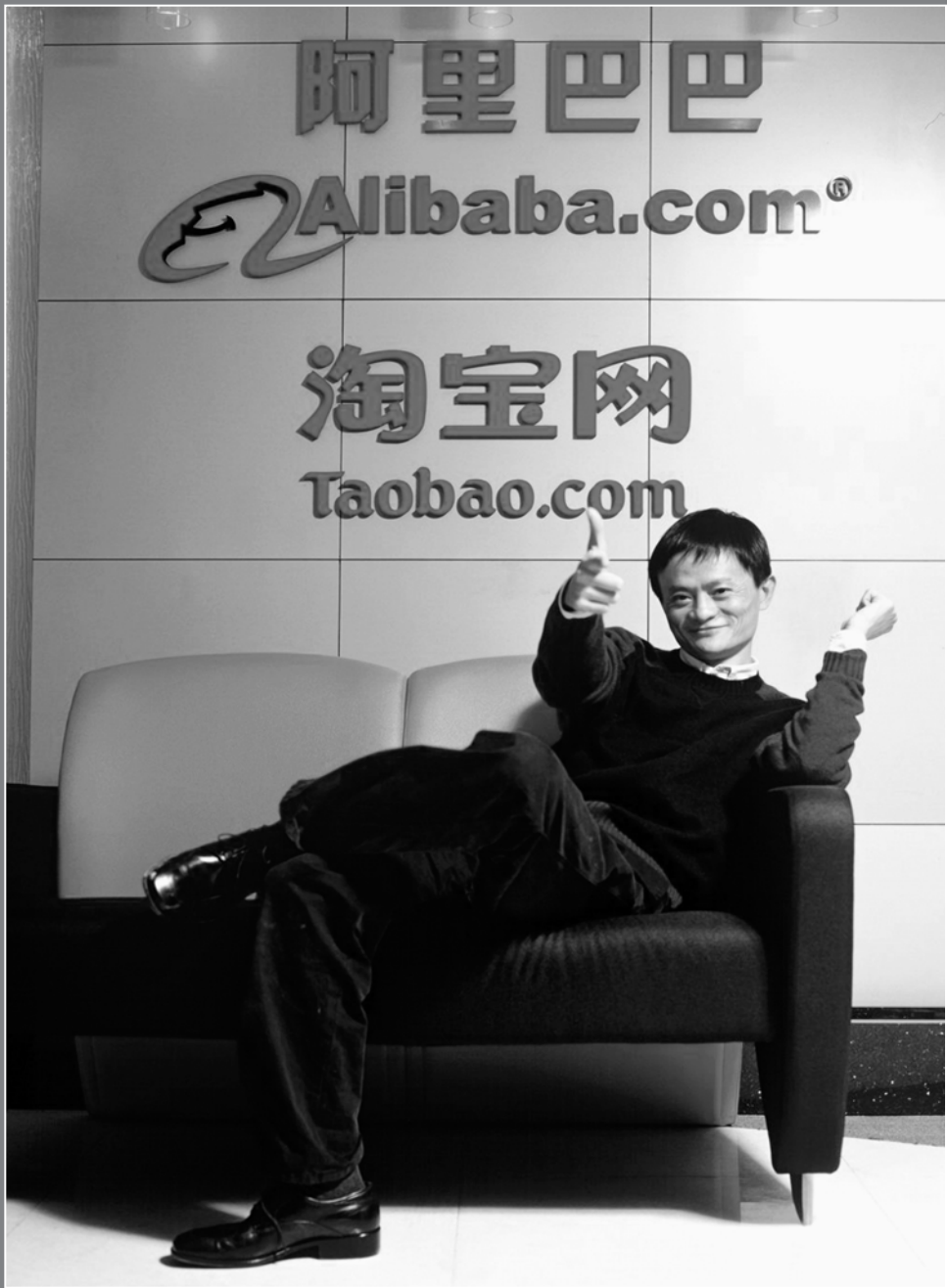
Jack Ma giving a sign of confidence as he sits under the Alibaba and Taobao banners, visual representations of the empire he has created.