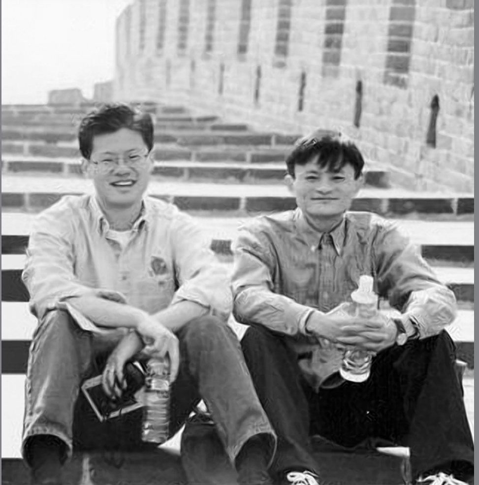
Jack Ma (right) and Jerry Yang (co-founder of Yahoo!), photographed on the Great Wall together in 1998. Ma and his colleagues had not yet founded Alibaba at the time.